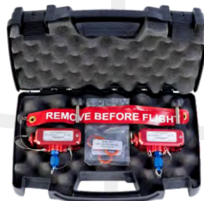
Adapter Kits Special application development on request