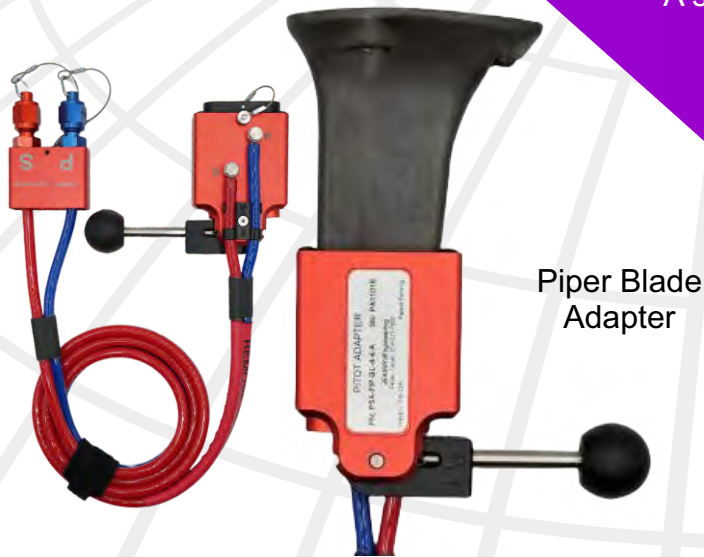
Piper Blade Adapter

Starting with a clean sheet of paper and no restrictions, we have created Pitot and Pitot-Static adapters to reset the benchmark. Patent Pending