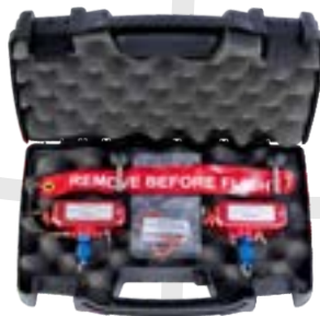
Adapter Kits Special application development on request