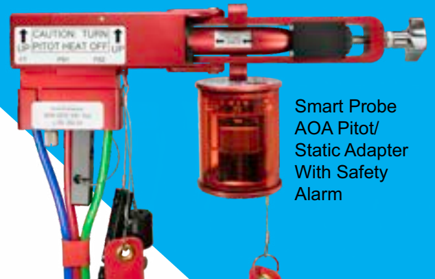
Smart Probe AOA Pitot/Static Adapter With Safety Alarm