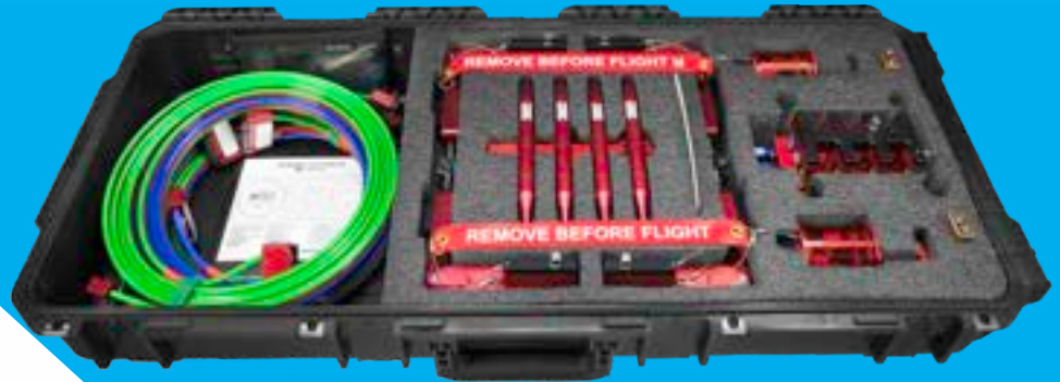
Custom fitted rolling case included.