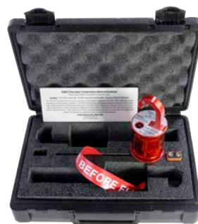
PN: PS-2 Kit